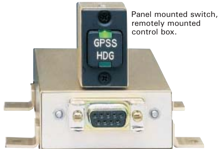
Units in photo shown actual size.

The GPS Roll Steering Upgrade for Your Existing S-TEC Autopilot